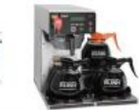
C Gold Peak 3-Carafe Coffee Brewer