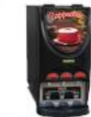
D Cappuccino Maker