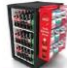
H UR30 Coolers