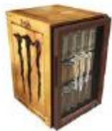
A Monster Java Cooler